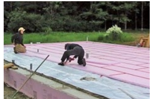
Under slab insulation example

While this style of slab insulation is most effective if it installed in contact with the entire underside of a slab, under slab insulation that only follows the perimeter of the slab is still much better for a home's energy efficiency than an uninsulated slab.