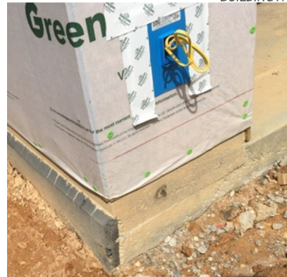
Misalignment of slab insulation on a garage foundation.