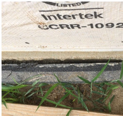
Slab insulation separated from the foundation.