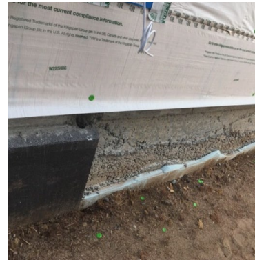
A large portion of removed slab insulation.