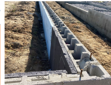
A stem wall missing insulation on the header block.