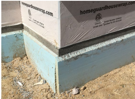
Monolithic slab insulation.